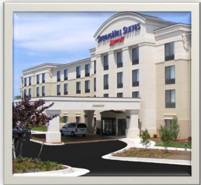
Shown above: Spring Hill Suites, located adjacent to the Lynchburg Regional Airport, is one of four hotels that Daly Seven currently operates in the Lynchburg area.

Eddie Gunter, the Campbell County Board of Supervisors member representing the Concord District, expressed support for the development. “We are very pleased to see the expansion of the Daly Seven project. Their original intention, when they purchased the site, was to construct two hotels and a restaurant,” stated Gunter. “Their first hotel unit, Spring Hill Suites, is a