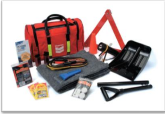
If traveling, basic emergency kits (as shown above) are good to keep on-hand, especially should conditions become too treacherous to travel.