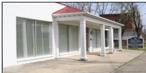
Patrick Henry Memorial Library 204 Lynchburg Avenue Brookneal, VA 24528 (434) 376-3363